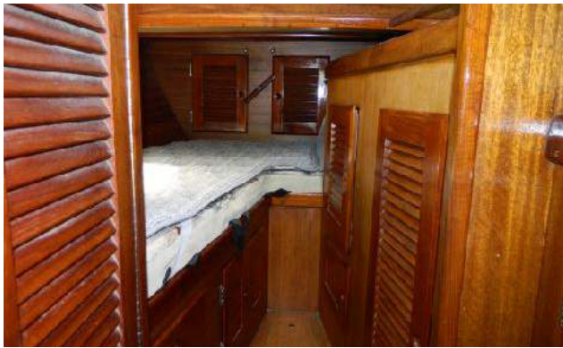
Looking into Forward Cabin