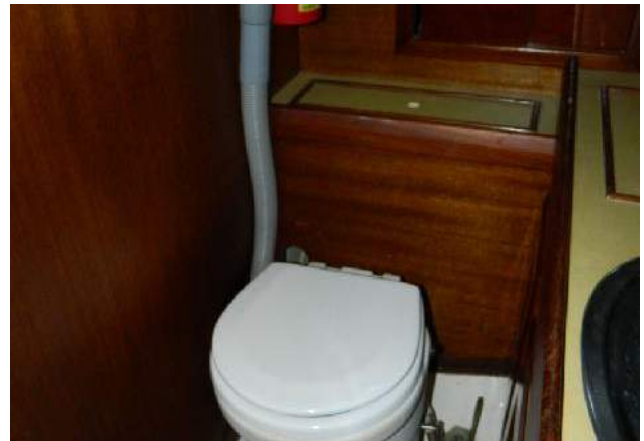
Airhead Composting Toilet in Head