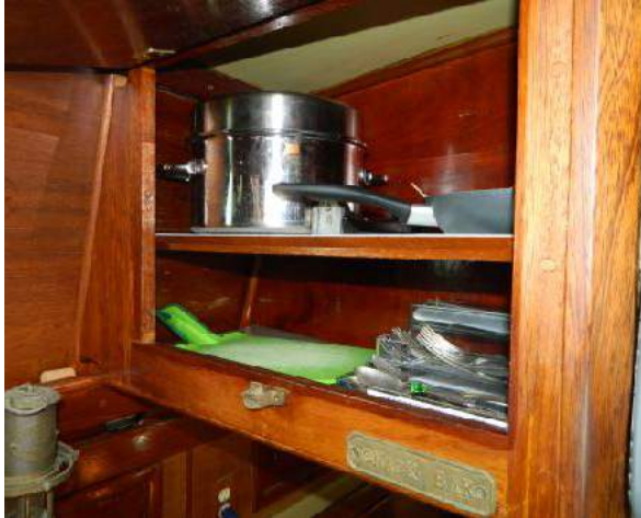
Custom Locker Over Icebox