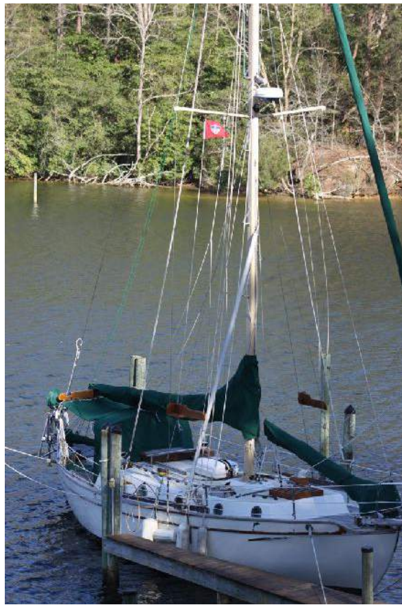
Calypso 1972 Hull #44