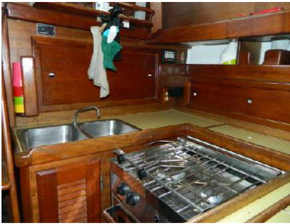
Galley w/ Double Stainless Steel Sink Galley, Gusher Foot Pump, and Storage