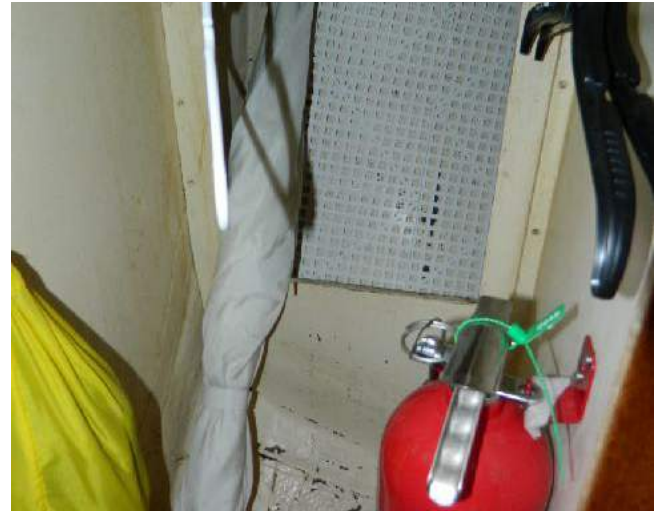
Aft Hanging Locker with Storage Outboard, Breeze Booster, & CO2 Fire Extinguisher