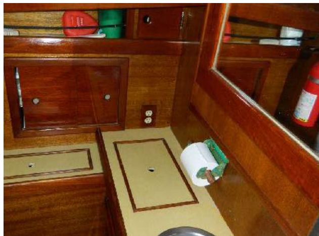
Head Sink and Medicine Chest w/ Mirror