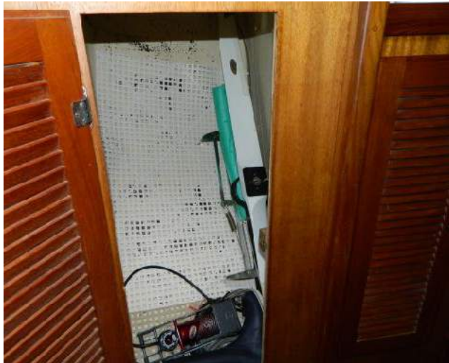
Forward Hanging Locker w/ Wind Generator Storage