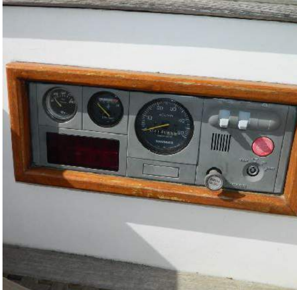
Engine Instruments in Cockpit