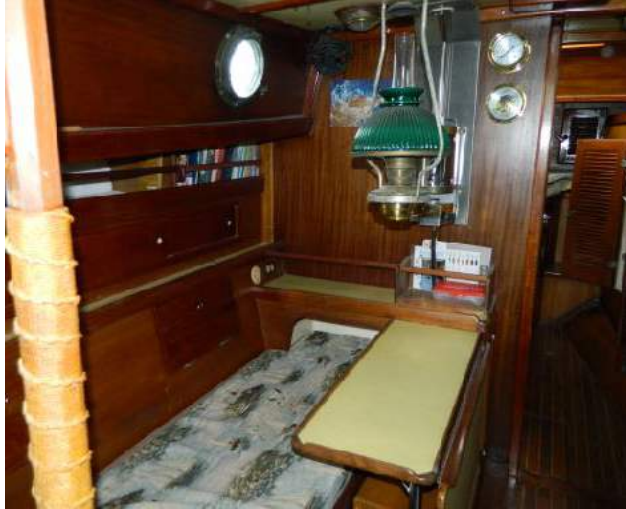
Main Cabin (Port Side)