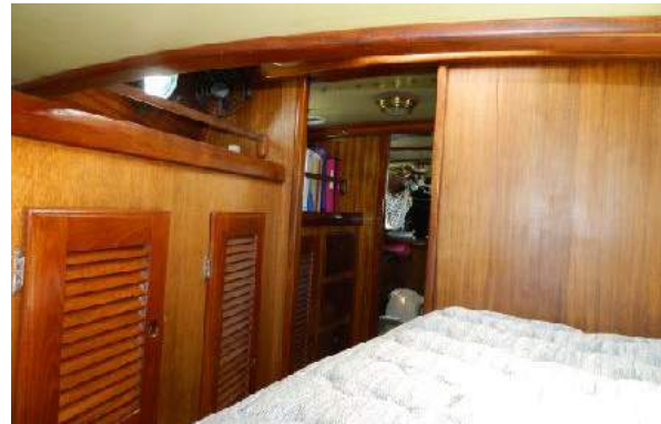
Forward Looking Aft