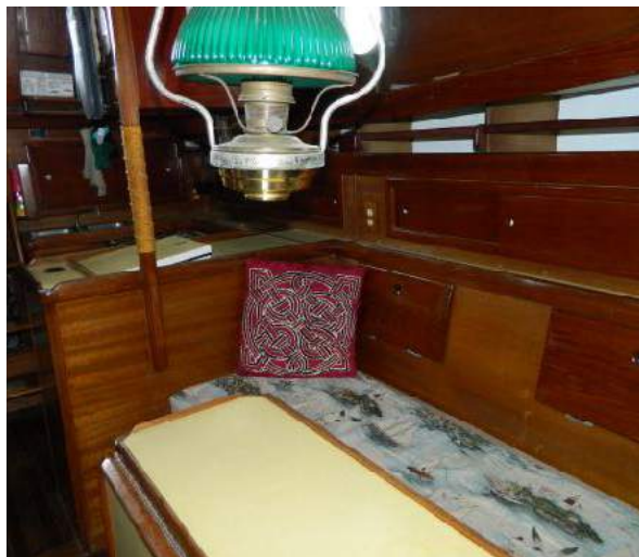
Main Cabin Looking Aft towards Galley