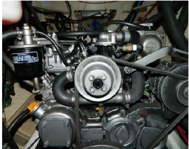
Well Maintained 56 HP Diesel