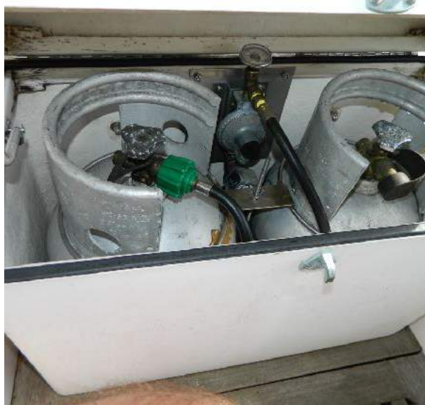
Propane Locker in Cockpit