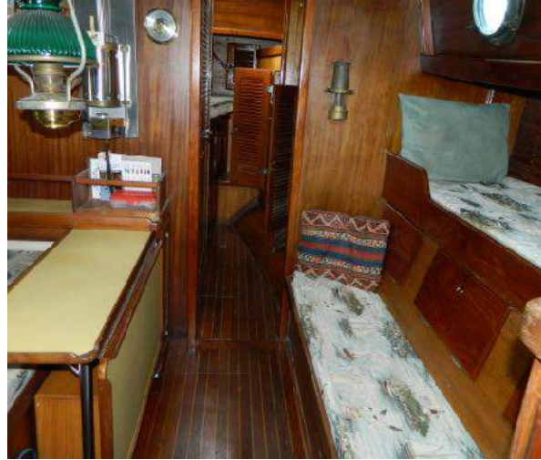
Main Cabin with Aladdin Lamp over DropLeaf Table and Force 10 Cozy Cabin Heater