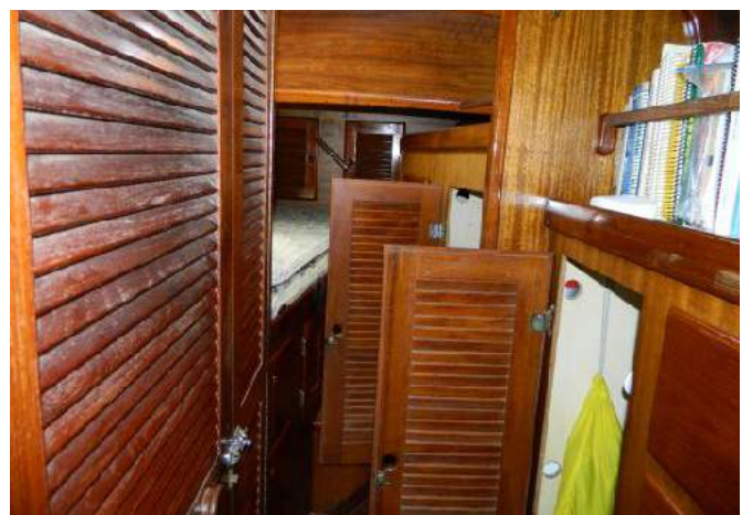
Looking Forward Head Door Port / Forward and Aft Hanging lockers