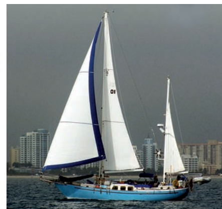
Varua , at left, is a cutter-rigged Westsail 42; others were rigged as ketches. Small World , the author's Westsail 42, hull #1, above, has been "maintained to perfection." This Bill Crealock design expanded the model line and gained publicity when Walter Cronkite purchased one. In 1975, its base price was $79,500.